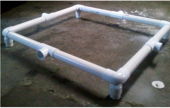
Figure 7: Pig rails made from PVC pipe