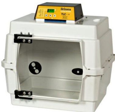
Figure 12: Brinsea Incubator