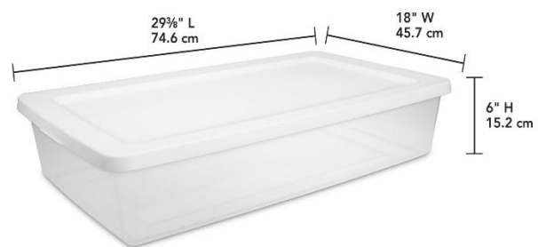
Figure 5: Storage Bin