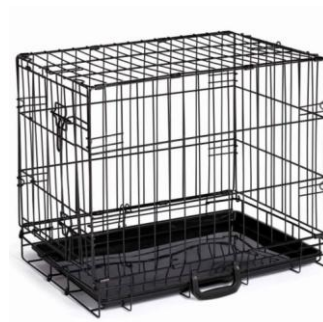
Figure 10: Dog Cage