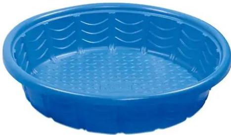
Figure 2: Kiddie Pool

This can be a simple plastic kiddie pool (Figure 1) or specifically designed whelping box (Figure 2). Raised garden planters like Figure 3 can also serve as great whelping boxes and for smaller dogs, a plastic underbed storage bin, Figure 4, can work very well too.