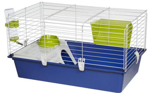
Figure 11: Critter Cage