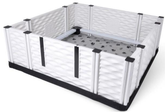
Figure 3 - EzWhelp Whelping Box