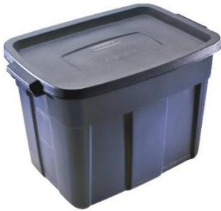
Figure 9: Storage Tub

Options for containment include but are not limited to a bathtub, plastic or rubber storage tub (Figure 8), a small dog cage or crate (Figure 9), a critter cage (Figure 11). Of course, an incubator is a wonderful tool to have but not everyone is going to invest in an incubator for fostering. But Figure 12 and 13 are two models that I've used and can recommend.