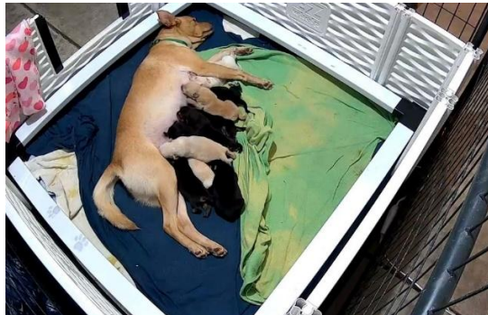
Figure 6: EZWhelp box with pig rails

Cons: Expensive (From $100 to $400 depending on manufacturer and size) and they're only available online. No local source.