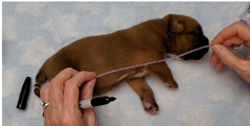
Figure 12 Measuring the tube

To mark the tube, lay the puppy on their side and lay the end of the tube along the puppy's abdomen down to the last rib as shown in Figure 12. That is where the stomach will be.