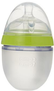
Figure 115: Comotomo baby bottle

Small Animal Nurser Bottle – These bottles are readily available and can be useful for tiny breed puppies.