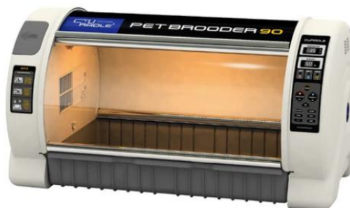
Figure 13: Curadle Pet Brooder Incubator

Whatever you choose to use, it is important to consider whether or not it can: