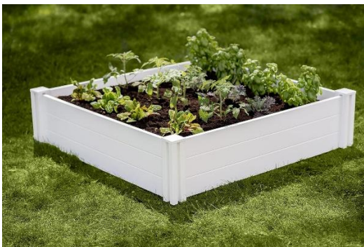
Figure 4: Planter