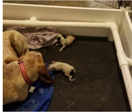
Figure 8: Pig rails in a garden box